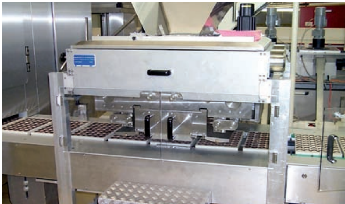
The RFID monitoring system instantly emits an alarm if inserted molds are not suitable for the production process underway

guidelines, not least in terms of quality management. The system can easily identify whether a cleaning cycle has been correctly followed. Today it is possible to closely track production sequences, such as pushing together molds in the cooling cabinet or exchanging them for special test samples during operation, thanks to RFID. This technology also instantly emits an alarm if inserted molds are not suitable for the production process currently underway. Even a "flying" product change is possible.