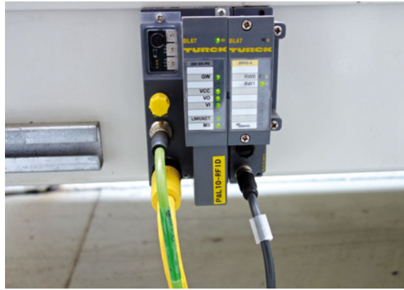
Turck's BL67 gateway transmits the data via Profinet to the PLC

Moreover, information systems of various shops of the auto manufacturer are relatively independent before, and the exchange of a great amount of information is required when car parts are conveyed among shops. With Turck UHF labels on car bodies, data carriers pass through all shops along with the car bodies, thus ensuring consistent car information in production links, avoiding the step of transmitting information among car bodies, greatly simplifying the operation process and improving production efficiency.