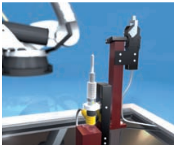
The magnetic field sensor forms the heart of the “smart location bolt”

expensive and unsuitable. Laser sensors are widely used for this purpose, but this too is an expensive and unreliable process. Adjusting the sensors is relatively