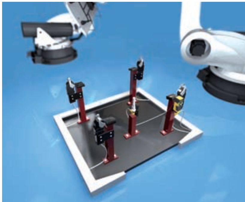
The new welding nut sensors are primarily used in chassis construction in the automotive industry