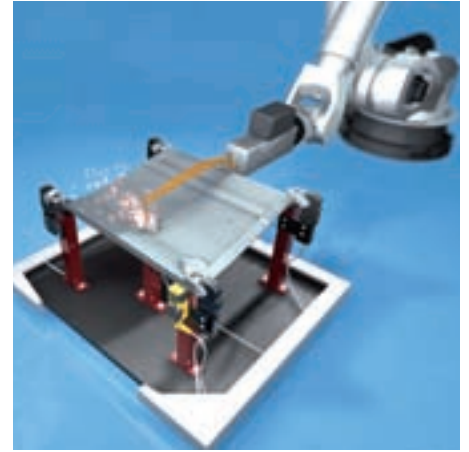
After release by the PLC, the welding robots score the nuts and bushings on the sheet metal

sent the most expensive solution. In addition, they are very time-consuming to program and particularly sensitive to changing light conditions. This method uses optical sensors or cameras and can guarantee process reliability only on a very limited basis.