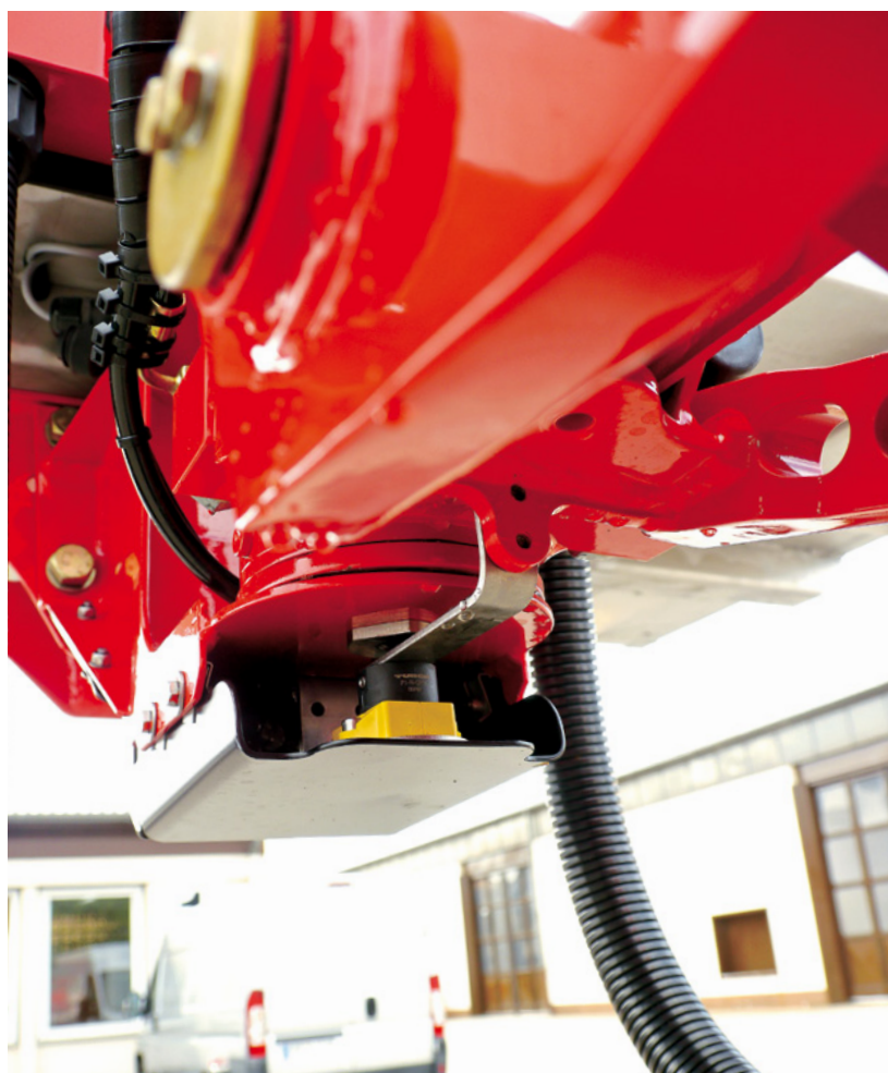
The compact Ri360-QR14 is reliably protected from mechanical damage by the steel cover

As the aerial platforms carry people, they must meet special safety requirements. The safety-related sensors and the controller in particular must have a redundant design. This is the case with all models from the small K 110 on a 3.5 ton base up to the TTS 1000. Sensors are used to measure the position of the telescopic arm on which the working cage is located. Many STEIGER® machines also feature a jib between the telescopic arm and the working cage. This jib