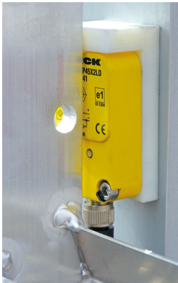
The Bi20-Q20 detects the folded ladder on the outer wall of the working cage

production of the TBR 200 and gradually introduce it as the standard in five other series: The Turck angle sensors now detect the swivel angle of the working cage in the TB 220, TB 270, the T 285, T 300.1 and the T 330. The number in the product name stands for the maximum working height of the particular STEIGER®. The TB 220 therefore allows a working height of 22 meters.