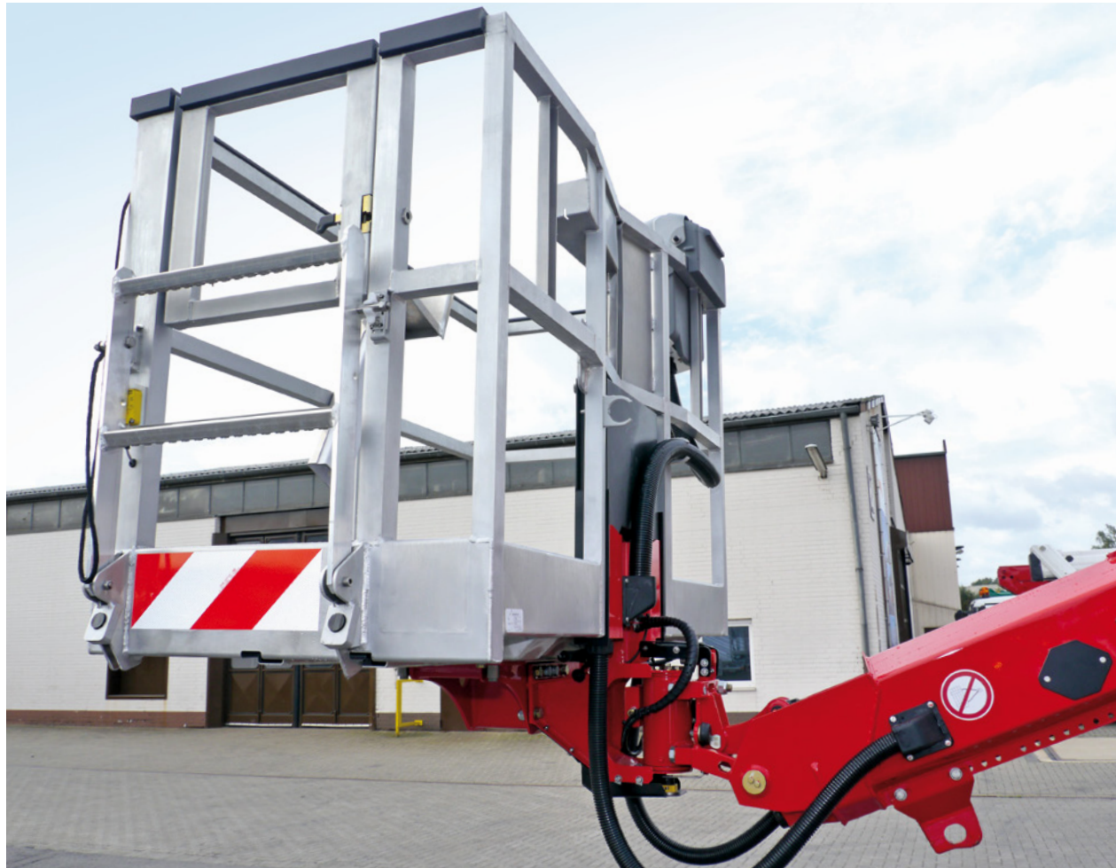
The angle sensor underneath the working cage measures the swivel angle of the cage

Ruthmann put the sensor through its paces for over four months in a demonstration model of a TBR 200. With a working temperature range of -40 to +70 degrees Celsius the angle sensor also operated perfectly in winter. After all the tests were successful, Post and his team decided to use the sensor in the series