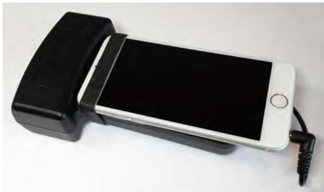
Silicone Retention Strap