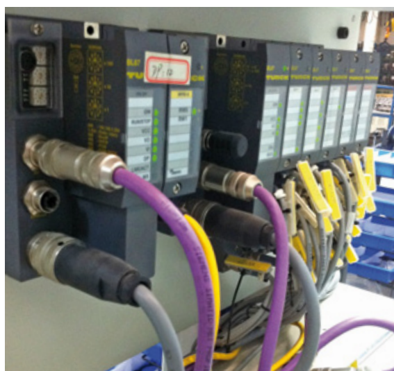
Turck's BL67 I/O system provides communication with the PLC via Modbus TCP and Profibus DP

As different fieldbus protocols are used in the application for different tasks, the modularity of Turck's BL ident RFID system made a good impression. The read/write heads on the line are integrated in the